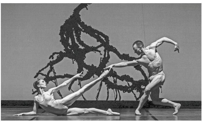
Ballet Austin premiered "Light / The Holocaust & Humanity Project" in 2005 and revived it here in 2012. It returns March 31-April 2 at the Long Center for the Performing Arts.